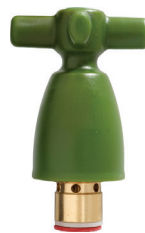
TAP ONLY 1/2" XV7-T0001 RRP $19.50