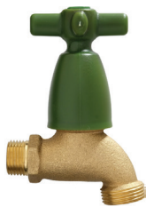
COMPLETE TAP 3/4" XV7-C80001 RRP $29.00