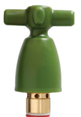
TAP ONLY 3/4" XV7-T80001 RRP $19.50