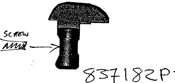
New Handle Boss